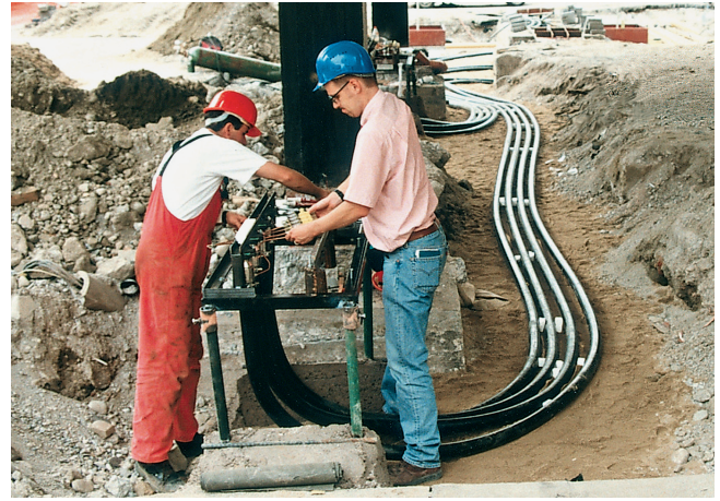
Easy installation on site