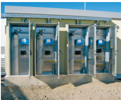
Simple securing of FLEXWELL® Safety Pipe using system technology