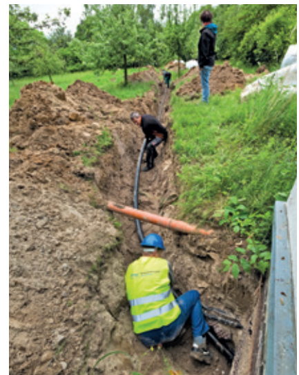
Routing around underground obstacles

In combination with our approved leak monitoring systems Class 1, which can be used without additional requirements in all plants subject to acceptance tests (LAU/HBV). Compliant with all water protection law regulations and the requirements of fire and explosion safety.