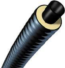
The flexible COOLFLEX system for smaller district cooling networks (house connections, residential estates, hotels and resorts, etc.)