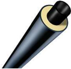
The rigid COOLMANT system for wide-area district cooling networks (urban buildings and office complexes, hospitals, shopping centers, etc.)